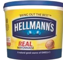
100 points HELLMANN'S Real Mayonnaise 5L