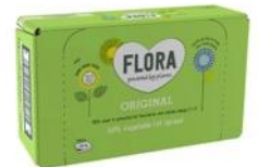
75 points FLORA Portions (100) AVAILABLE APRIL 2016