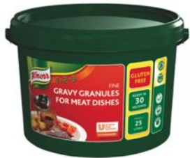
75 points KNORR Gravy Granules 25L