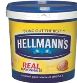
200 points HELLMANN'S Real Mayonnaise 10L