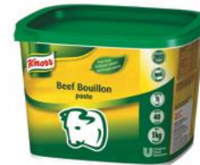
150 points On 3 x Varieties of KNORR Paste Bouillon 2 x 1kg

Sweet & Sour Korma Tikka Masala Tomato & Basil Szechuan