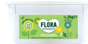
300 points FLORA ORIGINAL or BUTTERY 2kg