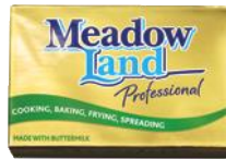
200 points MEADOWLAND Professional 40 x 250g